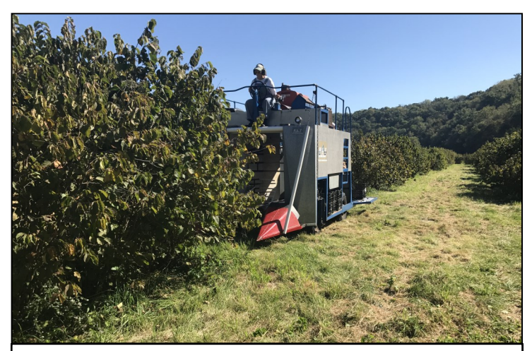
Photo 1. Hedgerow hazelnut production is an emerging opportunity for farmers and food manufacturers in the Upper Midwest. For years, the bottleneck has been lack of proven genetics, but with new cultivars becoming available the future is looking bright.

Hazelnuts are an emerging new high-value crop for the Upper Midwest. Efforts to establish the industry began in earnest in the 1990s with early-adopter growers establishing plantings of seedling hazelnuts across the Upper Midwest. Due to the genetic variability, the average yields from these seedling plantings have been too low to support commercial production, but recent identification of superior genetics will revitalize development of the industry. The Hazelnuts 101 Fact Sheet Series is intended to provide prospective hazelnut growers with practical information they can use as they explore the hazelnut opportunity. This Fact Sheet provides an economic model for hazelnut production in the