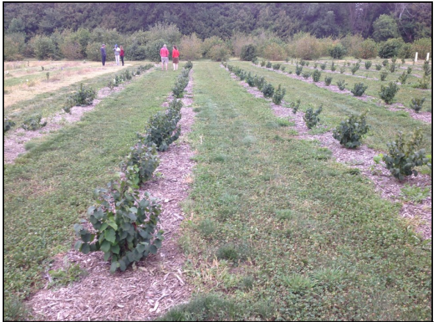
Photo 2. Year 2 of a hazelnut planting with perennial vegetation between the rows and wood chips and spot-application of herbicides to control weeds within the rows.

for layout and design recommendations. No costs for the well, pump, or electricity are included in this budget.